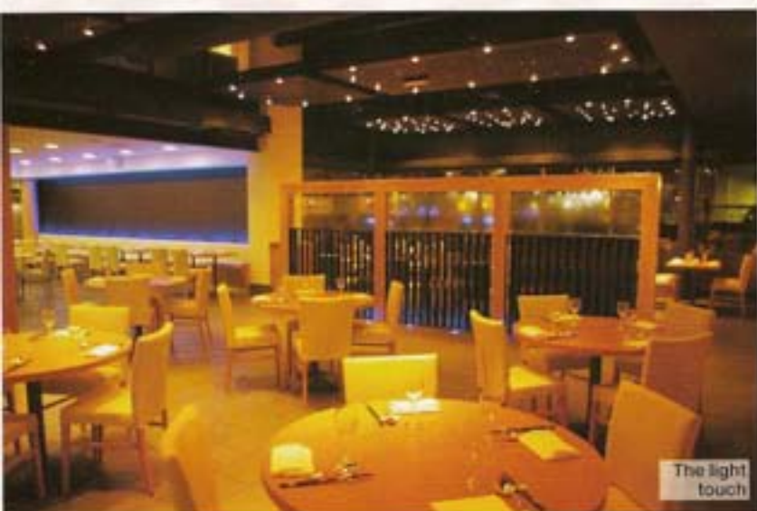
The light touch