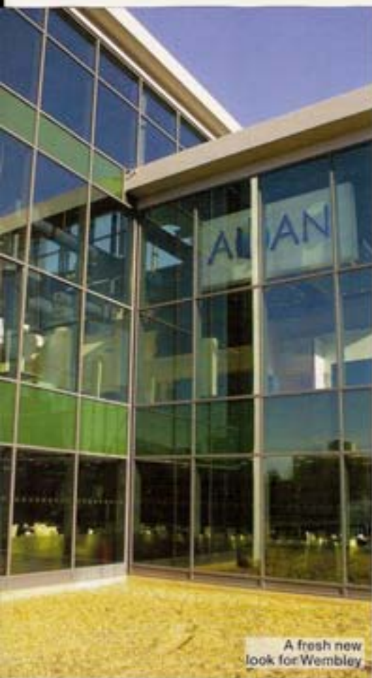
A fresh new look for Wembley