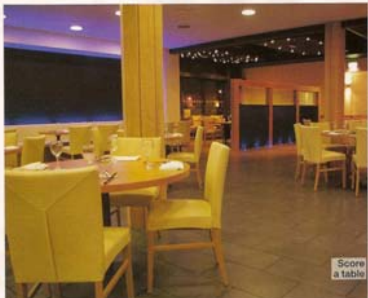
Score a table