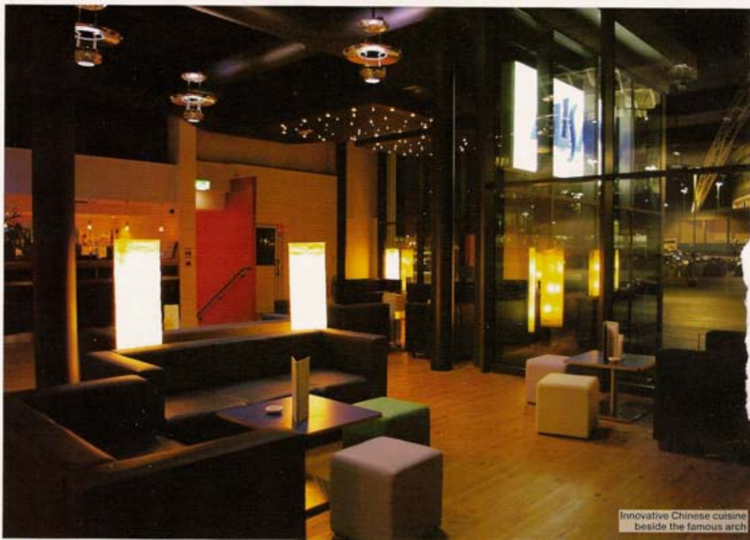
Innovative Chinese cuisine beside the famous arch

Alisan, The Junction, Wembley Retail Park, Engineers Way, Wembley, HA9 0ER. Call 020 8903 3888 or visit www.Alsan.co.uk .